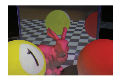
Figure 6: An example of hybrid rendering. Notice the correct occlusion of spheres and physical bunny and the missing reflection of the bunny in the mirror.

chosen for our implementation. Random numbers, required for multi-sampling, are generated on the fly on the GPU using a pseudo random number generator with a small common state buffer.