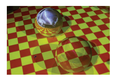
Figure 7: The scene from Whitted's ray tracing paper reimplemented in SAR.

Primary order rays and intersections are cast from the projector and intersect an object. They create secondary rays and intersections through reflective or transparent materials.