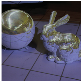
Figure 1: Non-augmented props and view-dependent ray tracing using a Spatial AR system.

Extended Abstracts of the IEEE International Symposium on Mixed and Augmented Reality 2013 Science and Technology Proceedings 1 - 4 October 2013, Adelaide, SA, Australia 978-1-4799-2869-9/13/$31.00 ©2013 IEEE